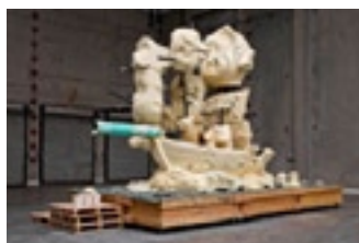
Paul McCarthy Ship of Fools, Ship Adrift 2 | 2010 This project was made possible through the generous support of the Anita and Luca Belgiorno-Nettis Foundation

Paul McCarthy, one of the most influential and provocative artists in the United States today, has spent much of his career critiquing and exploring western society’s obsessions – its mass media, popular culture, and icons of its consumer, entertainment and art industries. In reaction to the excesses of consumer capitalism, ‘Disneyfied’ banality and misplaced feelings of entitlement, McCarthy has developed a subversive vocabulary that twists, perverts and exaggerates the world around him to a heightened and crazed state. A new sculpture by McCarthy premieres at Pier 2/3, Walsh Bay. Ship of Fools, Ship Adrift 2 (2010) is a contemporary rephrasing of the medieval allegory, depicting a world of power without principle as the ship and its denizens hurtle obliviously towards their own destruction. Constructed from foam, the child-like faces of the caricatured inhabitants float dumbly above the ship that sports an implausible gun barrel mounted on its prow.